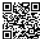
A140 3D demo