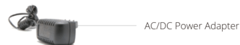
AC/DC Power Adapter