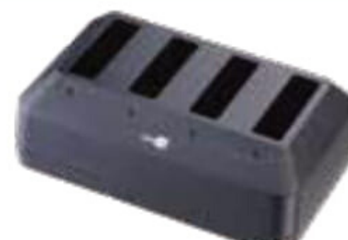
4-slot Battery Charger