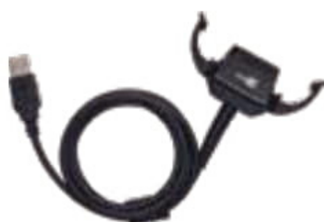
USB snap-on cable