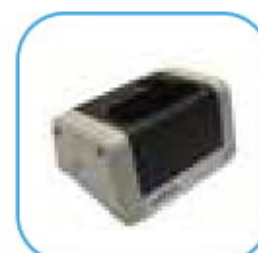
1 Slot charging cradle