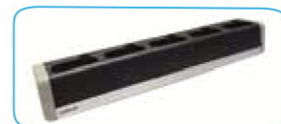
5 Slot charging cradle