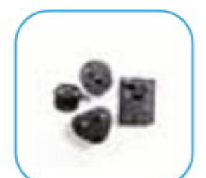
Power Adapter USB outlet

Hand-strap Micro USB to USB cable 1 Slot charging cradle (optional) 5 Slot charging cradle (optional) USB Power adapter (optional)