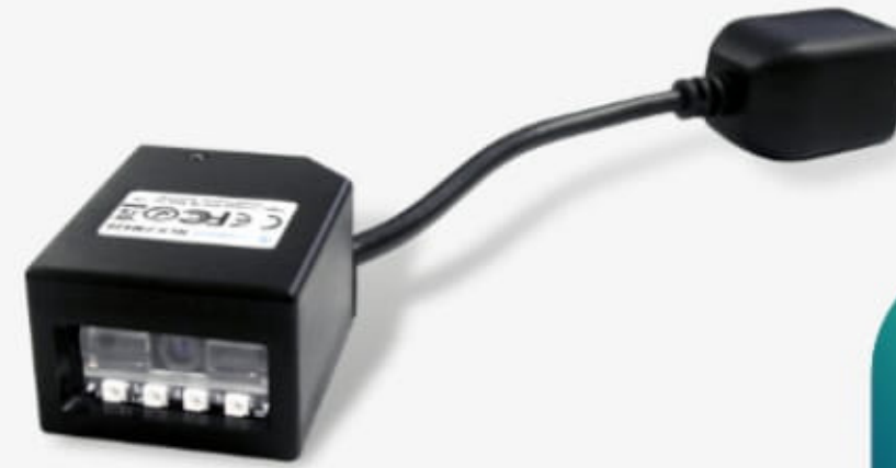
FM100 stationary scanners