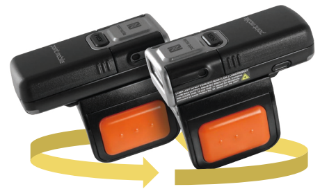
AMBIDEXTROUS RING TRIGGER

For the further inquiry, please contact: service@pointmobile.com