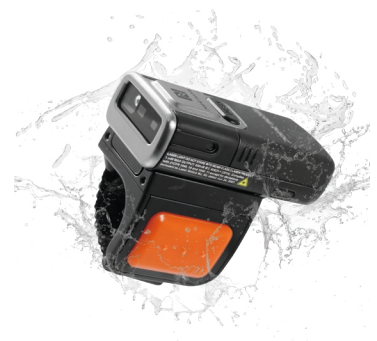
IP65 WATER/DUST RESISTANCE