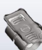
• Wearable Holder