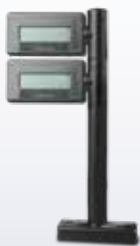
Multiple options available in English or Metric units