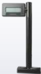
Multiple options available in English or Metric units

*Value reported in Eco Mode configuration.