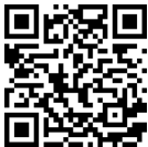
ZX10-EX 3D demo