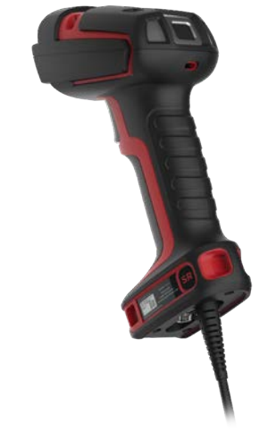
Granit™ Ultra 2100iSR Scanner

To learn more about how Granit Ultra is ready to improve your operations, contact your Honeywell representative or partner today.