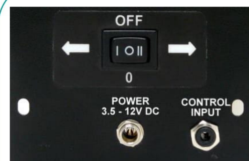
External Control Option Rear Panel