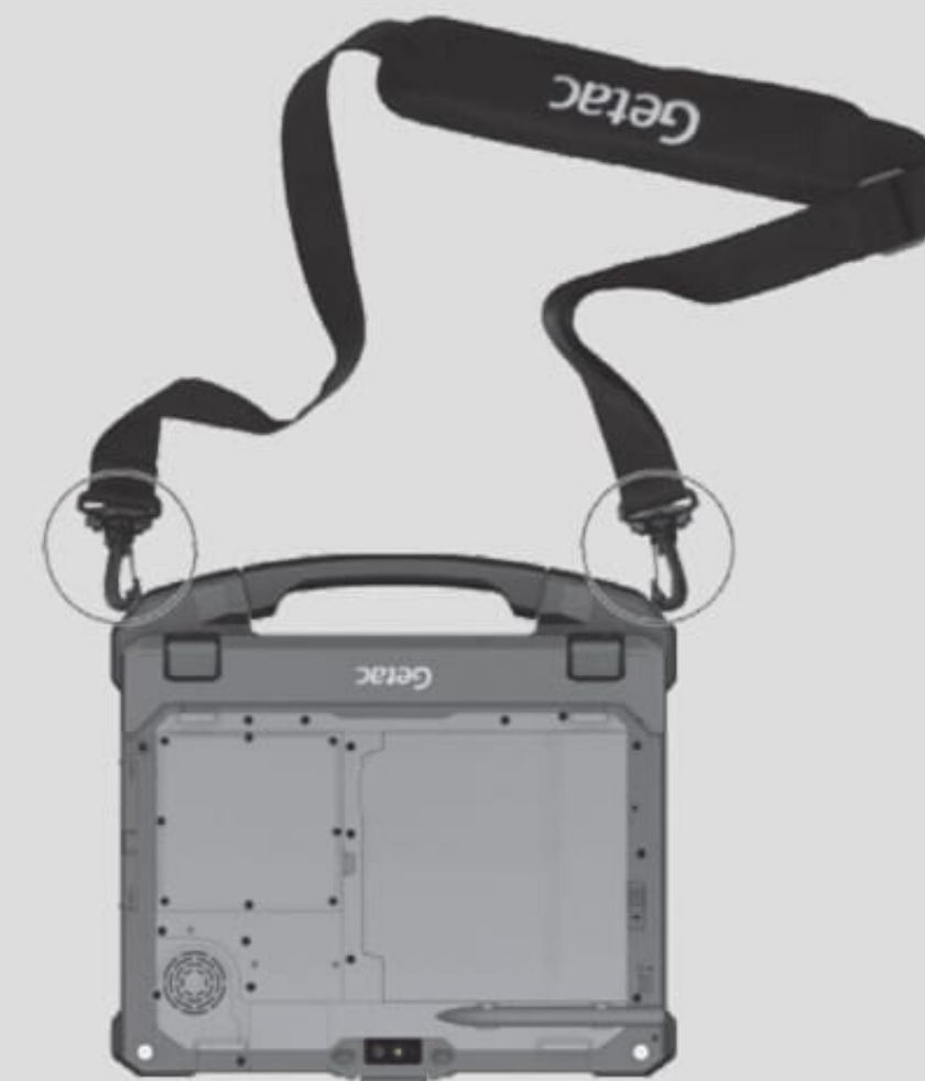
Attaching to the Detachable Keyboard