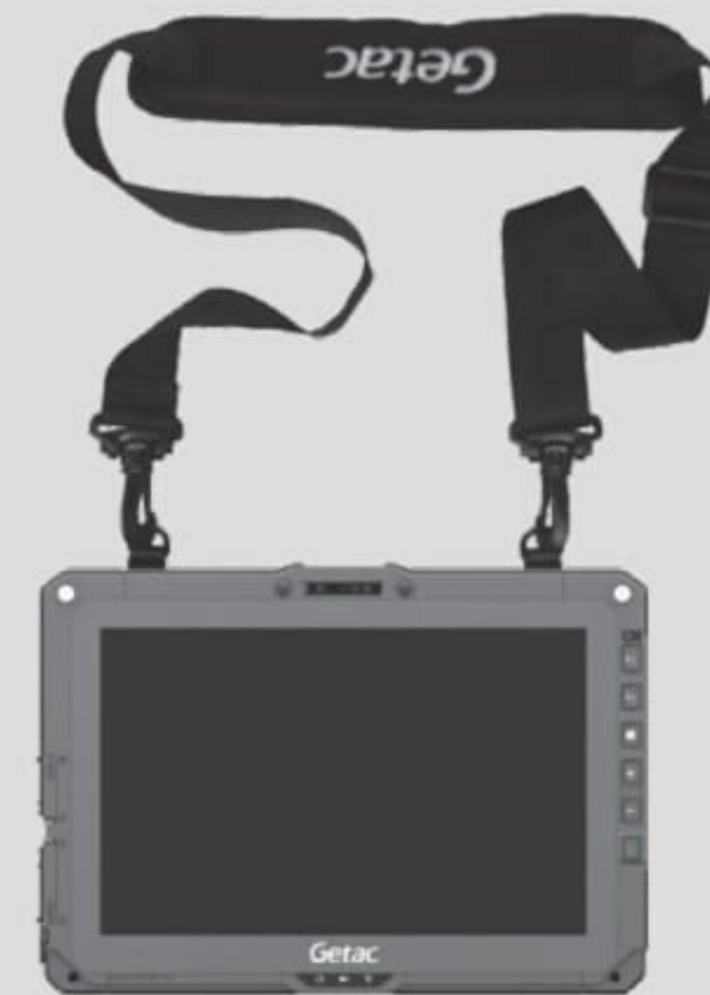
Attaching to the Tablet