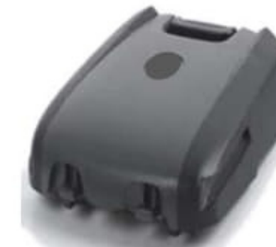
KTBTYRS50EAB00-01 Standard Lithium Ion battery, 970 mAh