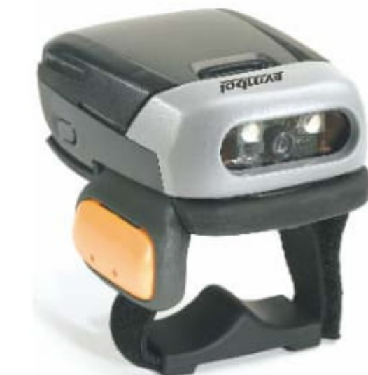
RS507-IM20000STWR Imager with trigger and standard capacity battery