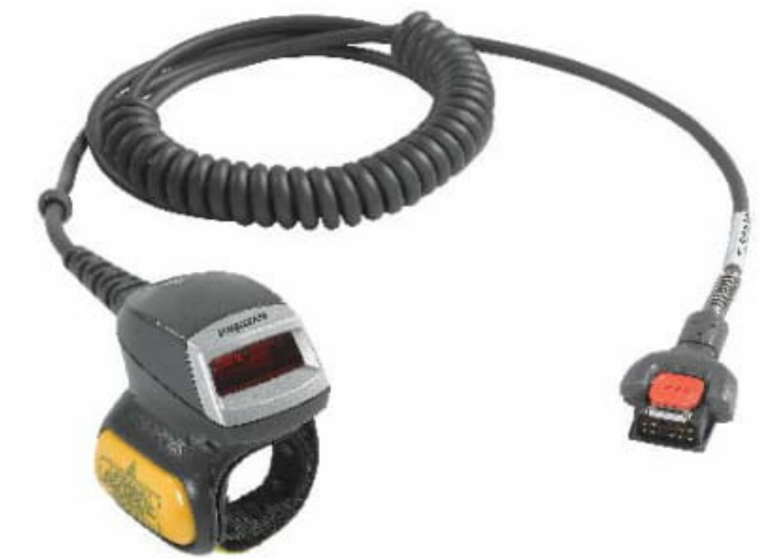
RS419-HP2000FLR Ring scanner with cable to waist