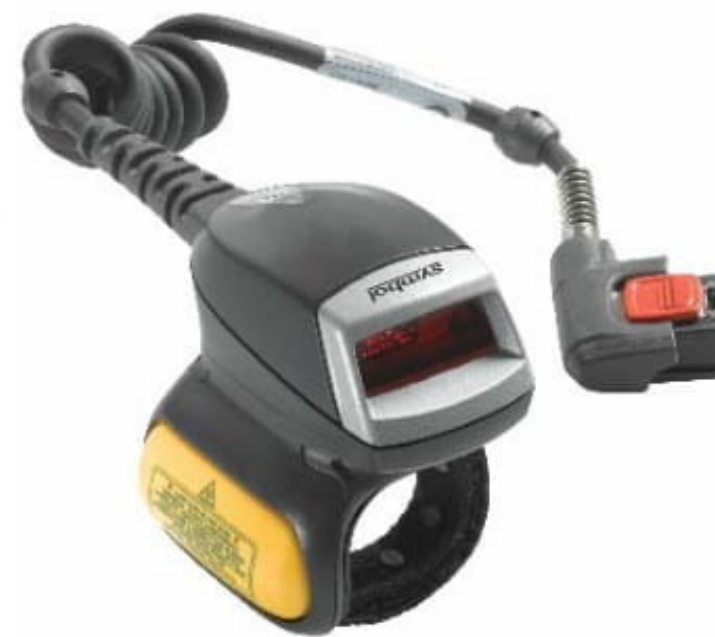
RS419-HP2000FSR Ring scanner for WT41 wrist mounted.