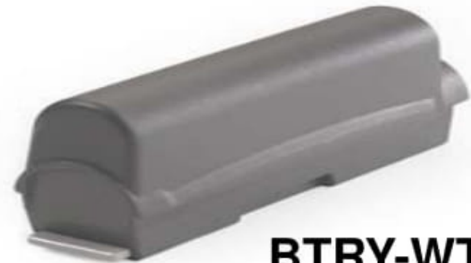
BTRY-WT40IAB0H Extended Lithium Ion battery, 4600 mAh