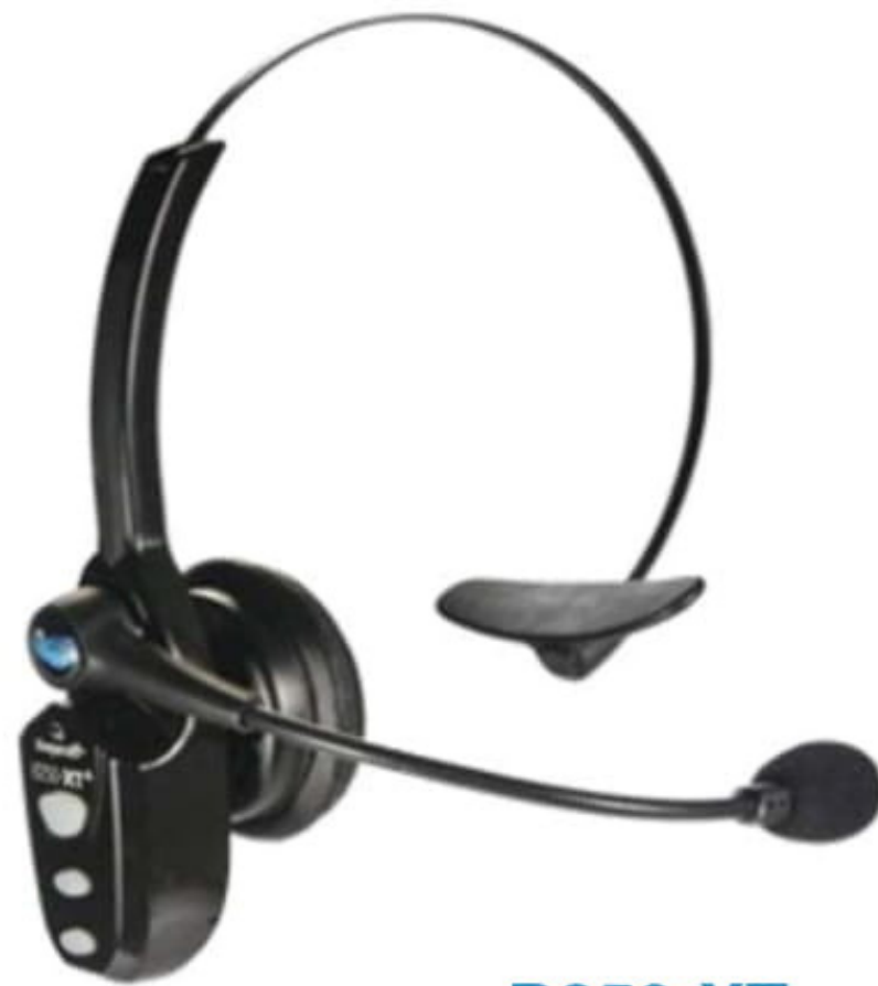
B250-XT+ Bluetooth Headset for WT41N0