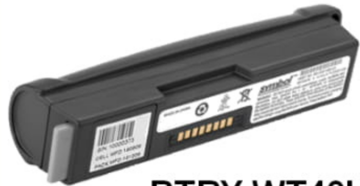
BTRY-WT40IAB0E Standard Lithium Ion battery, 2330 mAh