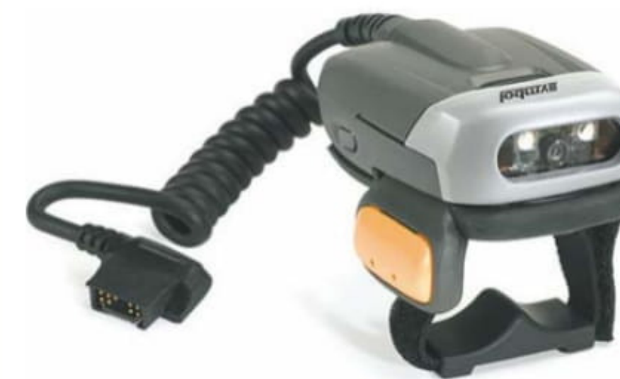
RS507-IM20000CTWR Corded imager with trigger