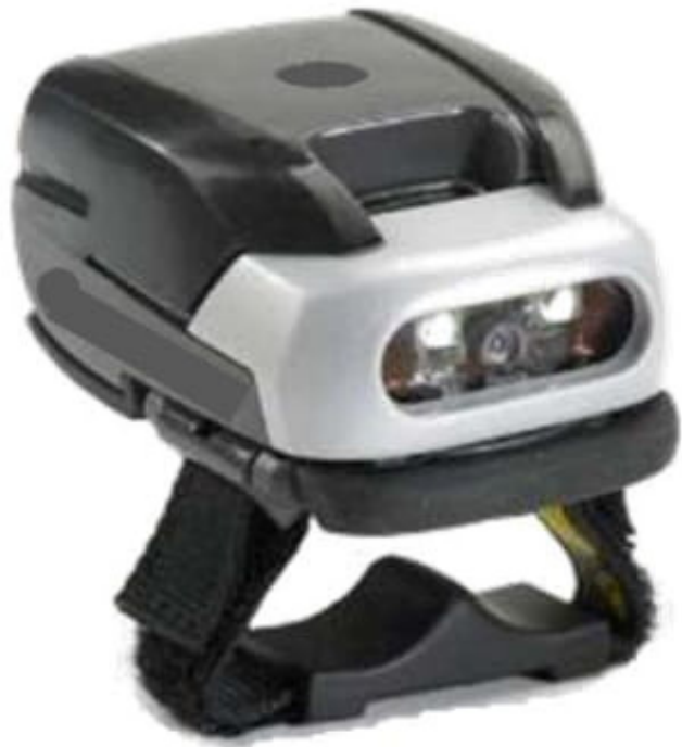
RS507-IM20000ENWR Imager without trigger and extended battery