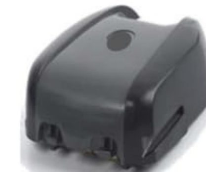
KTBTYRS50EAB02-01 Extended Lithium Ion battery, 1940 mAh