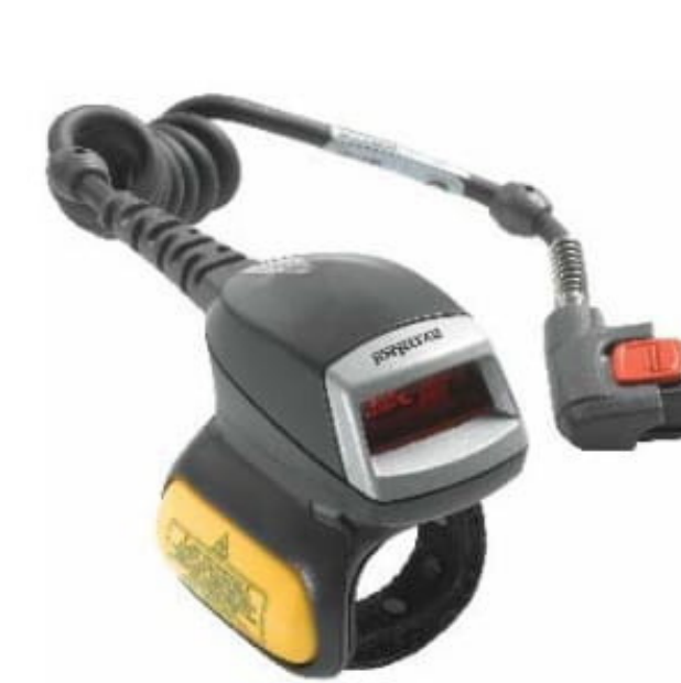
RS419-HP2000FSR Ring scanner with cable to wrist

RS419-HP2000FLR Ring scanner, to be used with the WT41N0 worn on the hip.