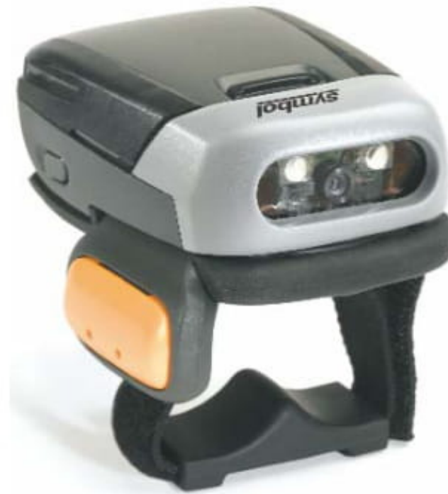
RS507-IM20000STWR Imager with trigger and standard battery