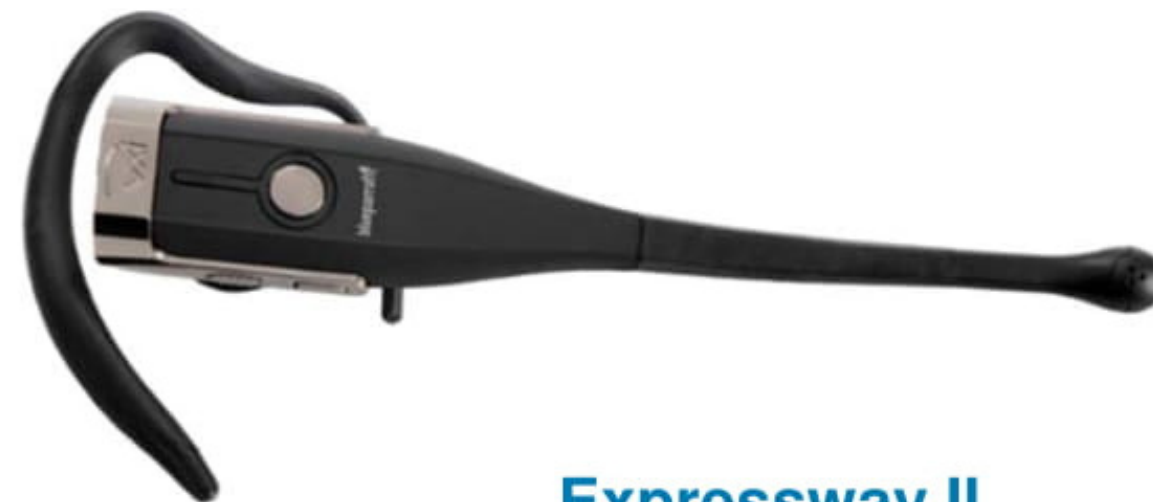
Expressway II Bluetooth Headset for WT41N0