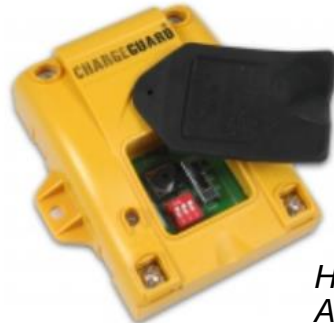
Havis Charge-Guard Auto Shutoff Timer