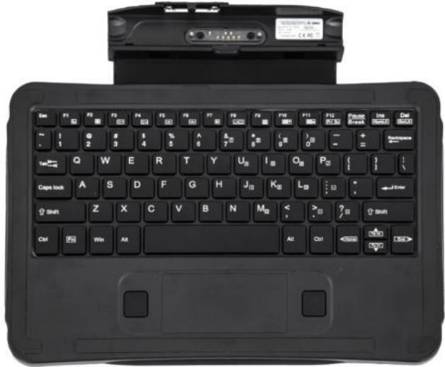
Rugged IP65 keyboard with backlighting

420095 (Rugged Companion Keyboard – US) 420096 (Rugged Companion Keyboard – UK) 420097 (Rugged Companion Keyboard – DE) 420098 (Rugged Companion Keyboard – FR) 420099 (Rugged Companion Keyboard – ES)