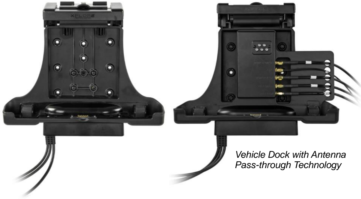
Vehicle Dock with Antenna Pass-through Technology