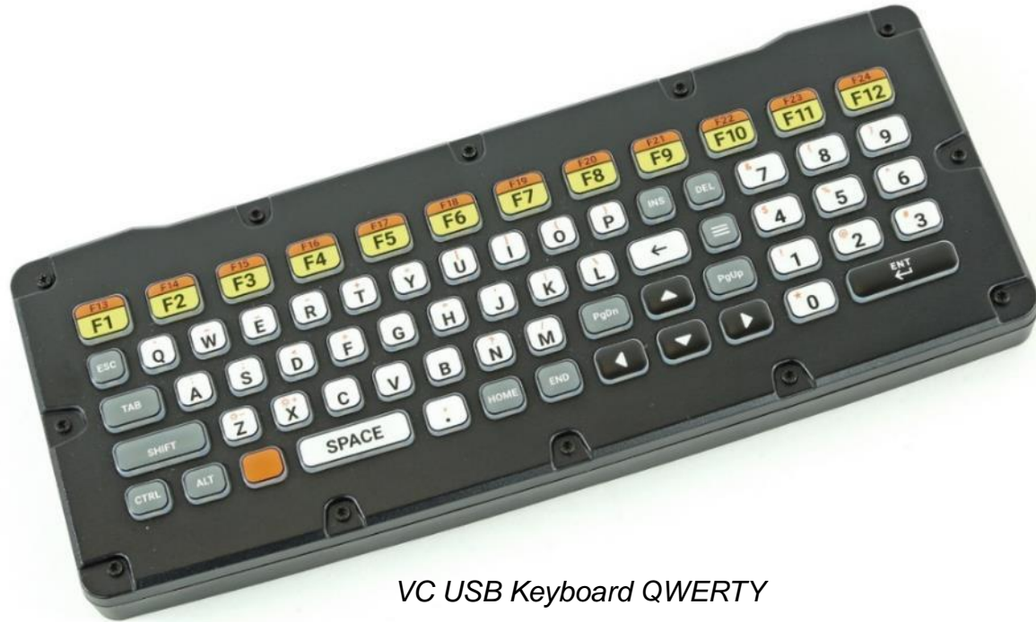
VC USB Keyboard QWERTY