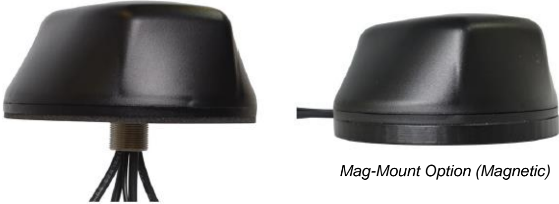
Mag-Mount Option (Magnetic)