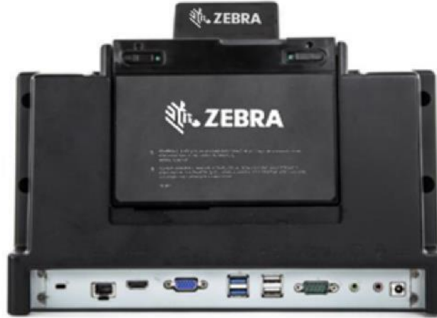
Back view showing optional battery charger (top) and I/O connectivity (bottom)