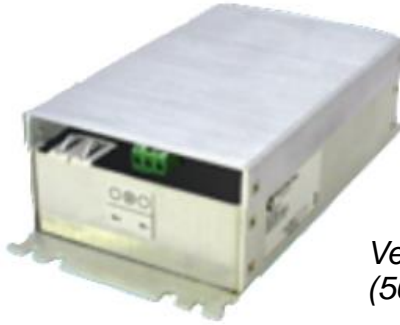
Vehicle Power DC Converter (50-150V or 9-60V)