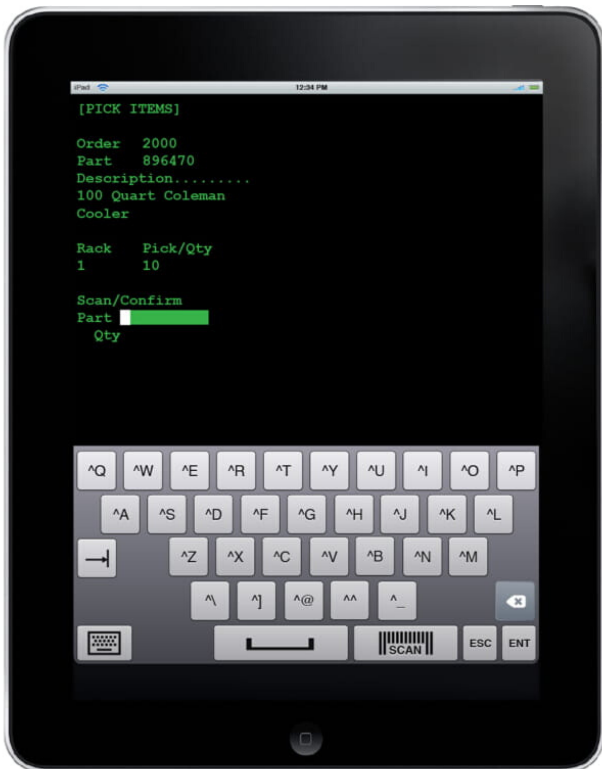
Ivanti continues to invest in TE, offering clients for Android and iOS (shown above on iPad).

At first glance, Terminal Emulation doesn't look like a 21st-century mobile application. Its "green screen" appearance looks like a software utility from the DOS platform days. Although it originated there, Ivanti TE has evolved alongside the mobile operating systems that have brought enterprise mobility to the present day.