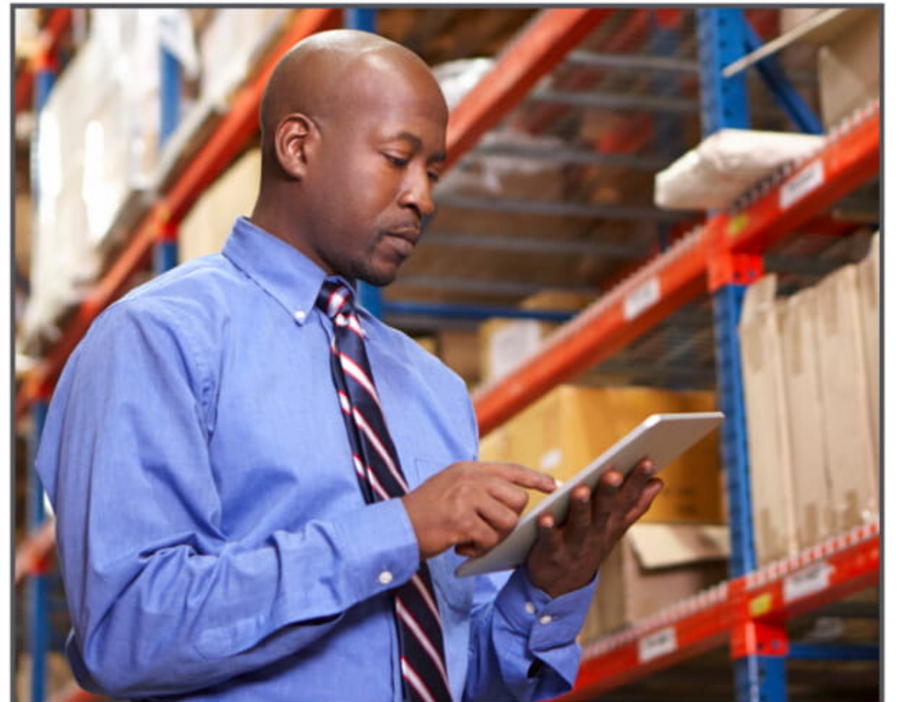
Over seven million Ivanti TE clients help capture mission-critical data throughout the supply chain.

In addition, Ivanti TE is uncomplicated and familiar. Its screens present simple fields for data population or review. The workflow is logical and familiar. Best of all, with Ivanti's Screen Reformatter capability, TE screens can be adapted to fit company-specific, unique mission-critical workflows.