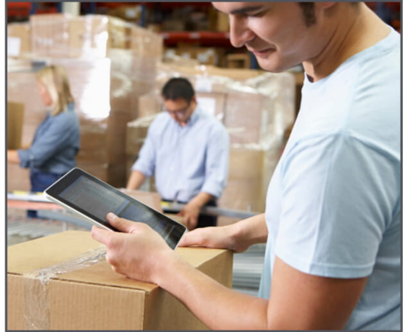
Ivanti TE is the only Terminal Emulation client recommended by leading supply chain management application providers.

They also don't need to worry about software compatibility. Ivanti TE is the only Terminal Emulation client recognized and recommended by the world's leading supply chain management application