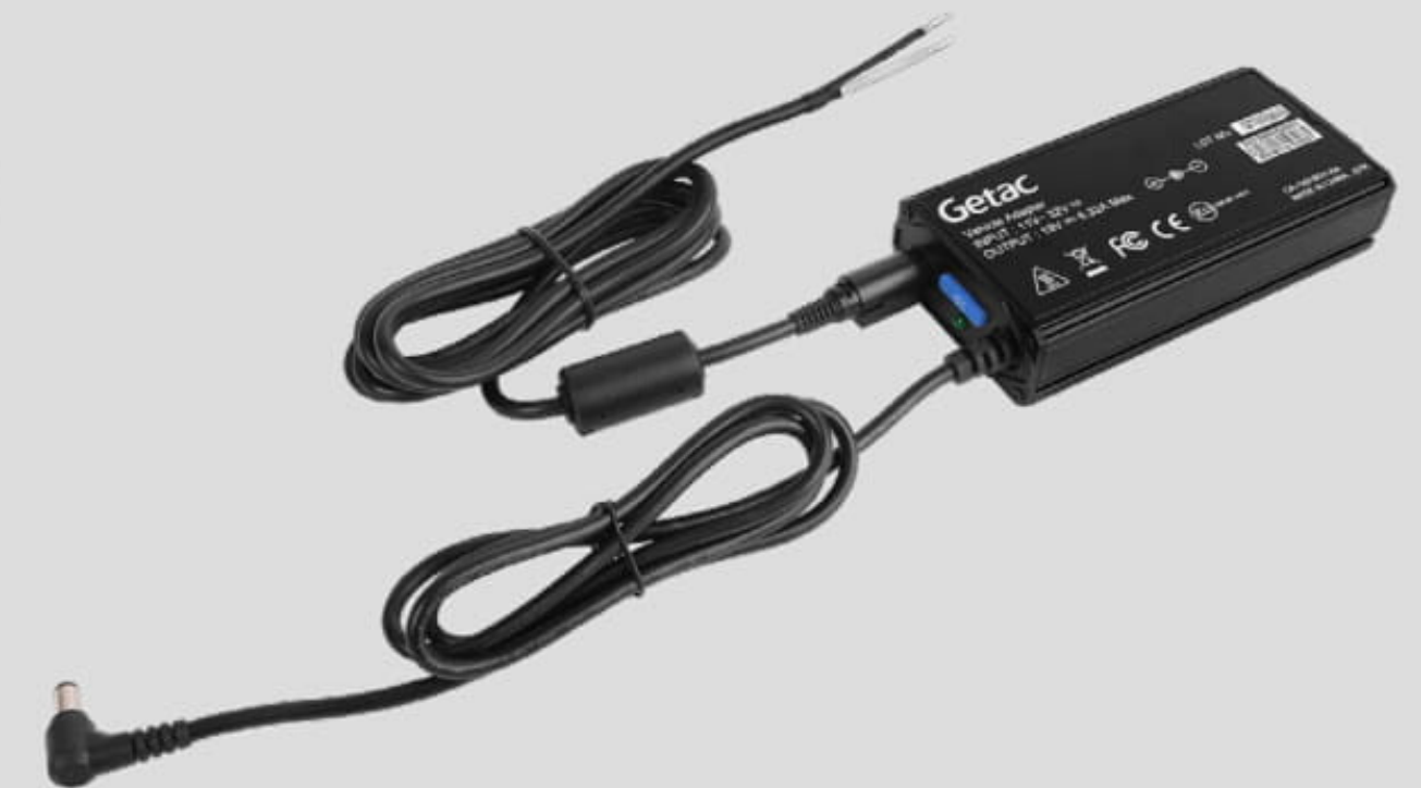
Bare Wire Version