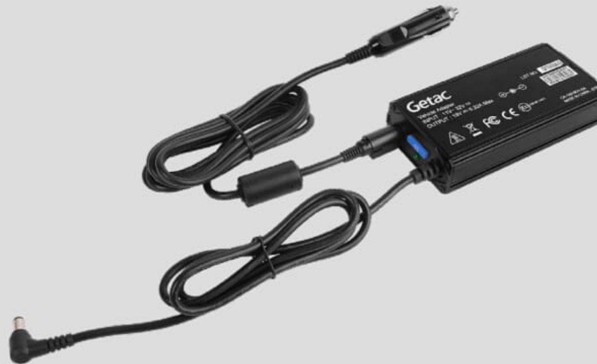
Cigarette Lighter Plug Version