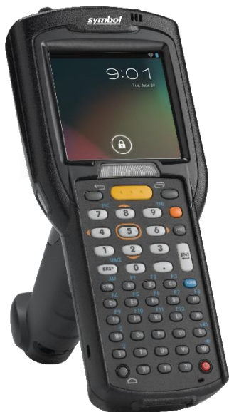
Android 4.1 Jelly Bean