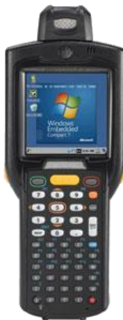
Microsoft Windows Embedded Compact 7.0