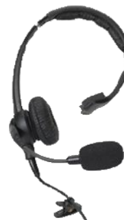
RCH51 Rugged Wired Headset