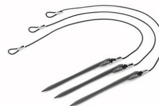
11-43912-03R 11-43912-50R Replacement stylus for brick configurations