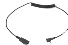
25-124411-03R Headset adapter cable