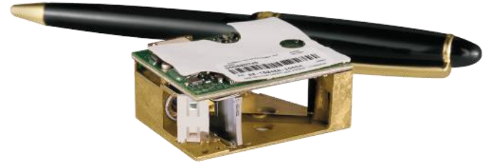
SE965 1D Standard Range Scan Engine

SE4750 1D/2D Standard Range Array Imager