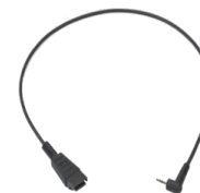
25-124389-01R Headset adapter