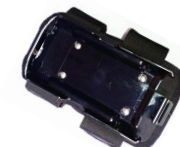
Wearable Arm Mount