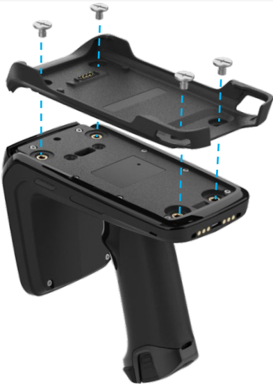
TC21/26 Sled Adaptor