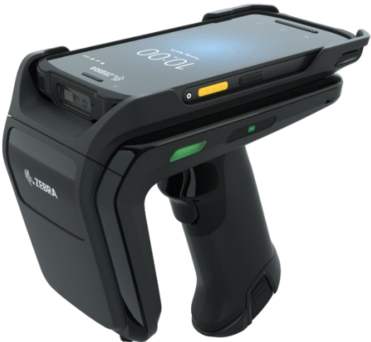
RFD40 RFID Sled