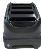
4-slot Battery Charger