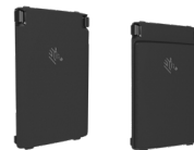
Batteries (3300 mAh, 5260 mAh)