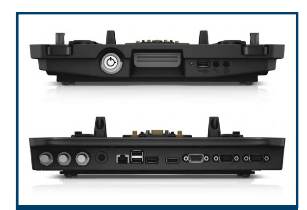
Front- and rear-facing port replication protects cable connections while integrated strain relief protects from accidental disconnects