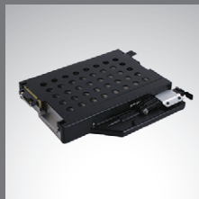
Multimedia Bay 2 nd Storage