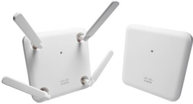
Figure 1. Cisco Aironet 1850 Series