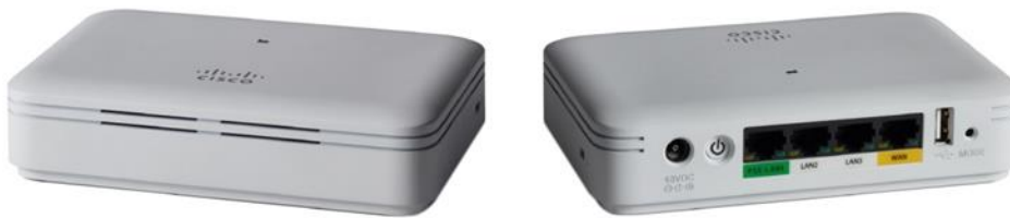
Figure 1. Cisco Aironet 1815t Access Point

The Cisco® Aironet® 1815t Access Point (Figure 1) offers a highly secure enterprise wired and wireless connection to the home, micro-branch, or any type of remote sites. No longer will geography or the elements play a role in delaying productivity, as the 1815t extends the corporate network to teleworkers, mobile workers, and even micro-sites. The access points connect to the home or on-site broadband Internet access and establish a highly secure tunnel to the corporate network. This tunnel allows remote employees access to data, voice, video, and cloud services for a network experience consistent with that at the corporate office. The 1815t supports highly secure access to corporate data and personal connectivity for teleworkers' home devices, with segmented home traffic.