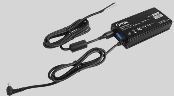
Bare Wire Version