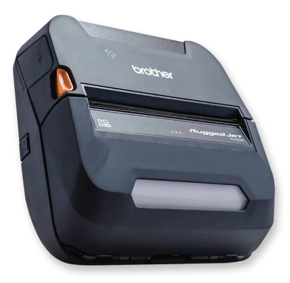
Labels, Tags and Receipts