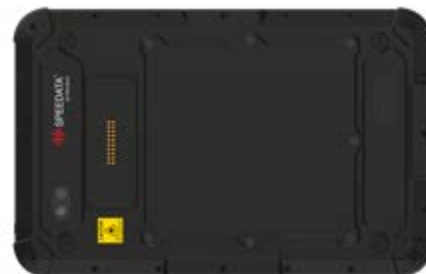
backside of the SD80