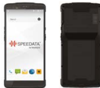
front and backside of the SD55UHF