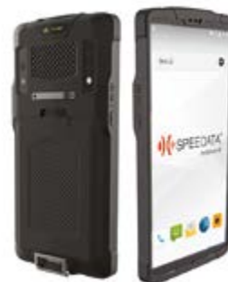
back and front side of the SD60