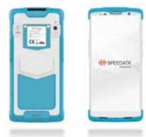
backside and front of the SD55MD