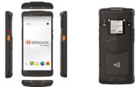
SD55 from all sides