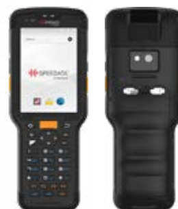
front and back of the SD35