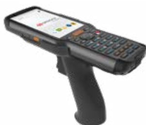
SD-PG35 pistol grip (optional)