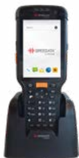
SD-CD35 cradle (included)