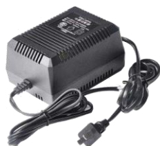
TEAC-66-243000V (EU) MKAC-66-243000U (USA) TEAC-66-243000VB (UK) Power adapter