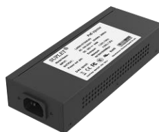
LAS60-57CN-RJ45 Hi-PoE Midspan