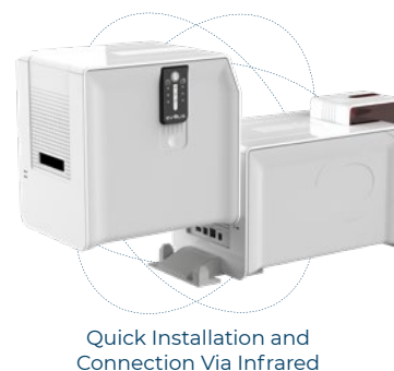
Quick Installation and Connection Via Infrared