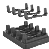
EDA10A-CB-0 EDA10A-CB-1 EDA10A-CB-2 EDA10A-CB-3 EDA10A-CB-5

EDA10A four (4) battery packs (EDA10A-BAT). Kit includes: charging base, power supply and power cord (-1 for U.S., -2 for Europe, -3 for UK, and -5 for AU).