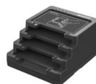
EDA10A-QBC-1 EDA10A-QBC-2 EDA10A-QBC-3 EDA10A-QBC-5

Ports: 3x USB-A, 1xHDMI, 1x RJ45 Ethernet.