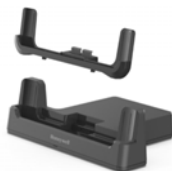
EDA10A-DB-0 EDA10A-DB-1 EDA10A-DB-2 EDA10A-DB-3 EDA10A-DB-5

Single charging dock for EDA10A with or without protective boot, compatible with hand strap. Kit includes: dock, convertible adapter cup (EDA10A-ADC), USB charging cable, 5V 2A power adapter, and plugs for US, UK, AU, EU, IN.