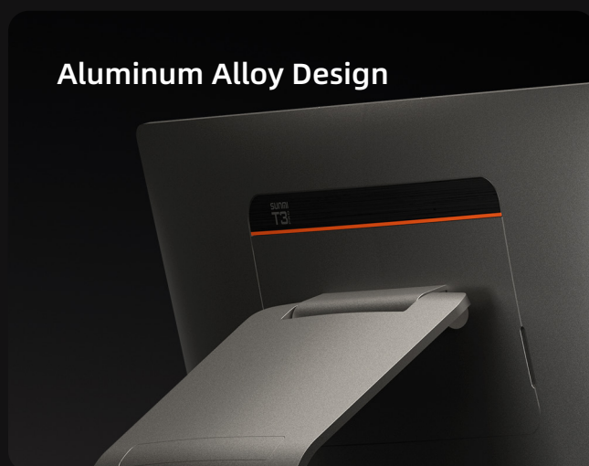
Aluminum Alloy Design