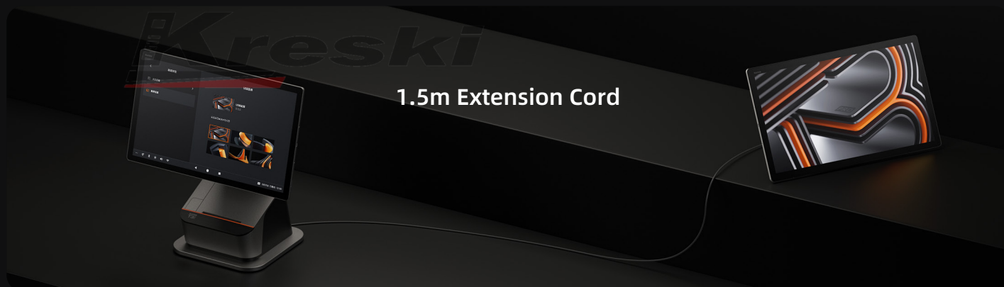
1.5m Extension Cord